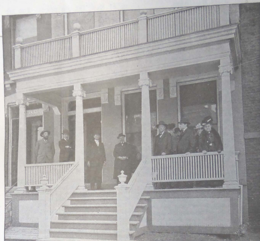
The April Class.

The class of The Atkinson School of Mental Science, which met on Monday, April 7, and continued during the week, was the opening class of the School. There was a fair attendance notwithstanding the fact that many who had thought of attending decided, at the last moment, to postpone their visit to Chicago until May, at which time Spring would be further advanced, and traveling and sight-seeing be performed under more favorable circumstances. The chances are that the May classes will be largely attended, and that the summer classes will be so large that we may be compelled to limit the number.