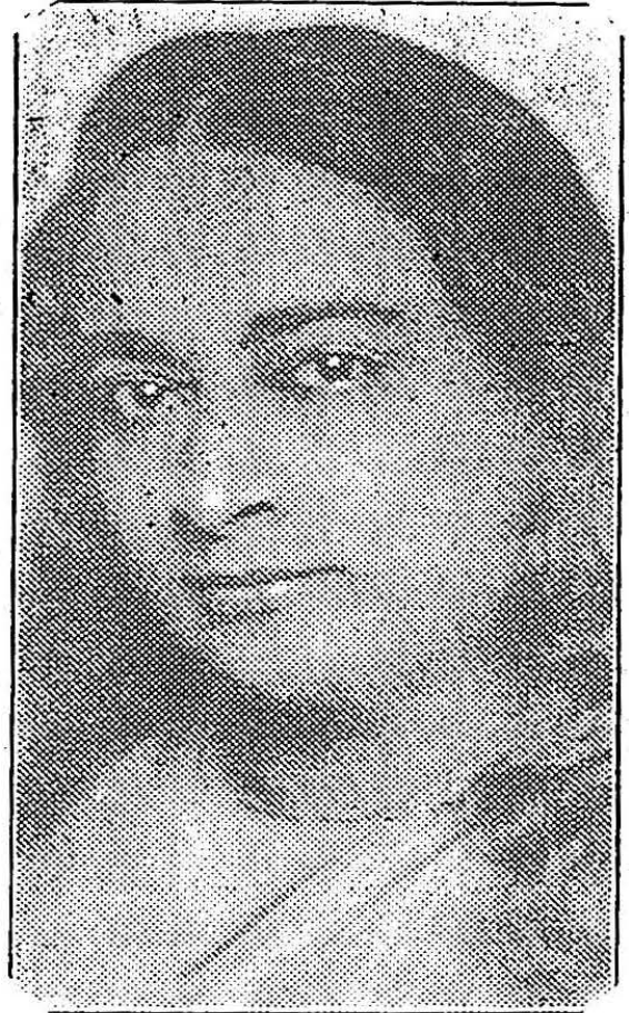
Swami Yogananda, A.B.

You must not pass up this opportunity to become acquainted with the Greatest Scientific System of Health and Happiness that has ever come to America.