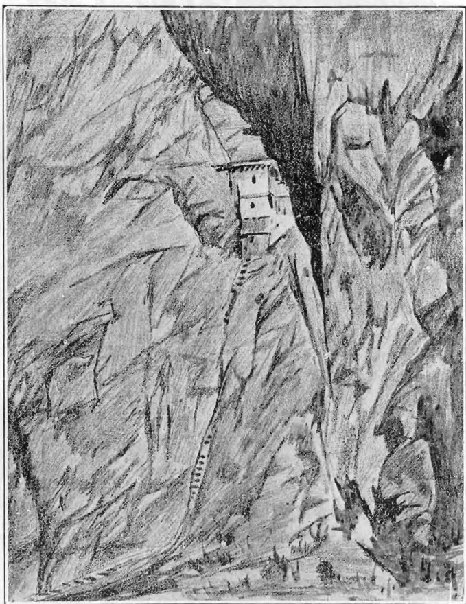
The Temple Pora tat sanga