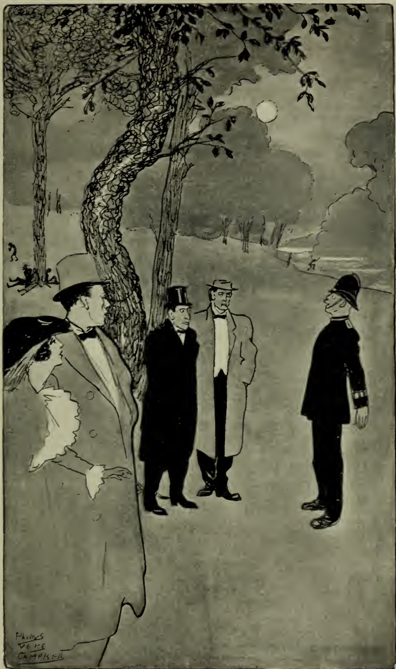
THEY GAZED FASCINATED