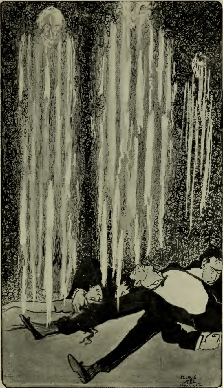
THE ROOM FILLED WITH LUMINOUS, STRIPED FIGURES