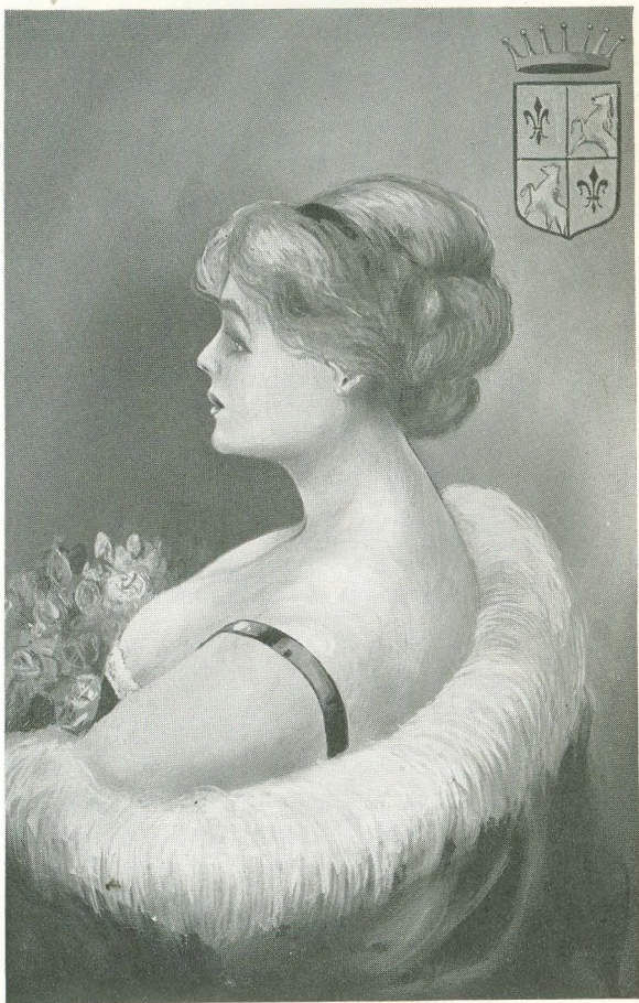
BARONESS OLGA VON DOBRZANSKY