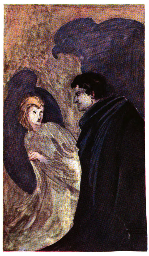
"He kept his eyes fixed on Lilla." [FACING PAGE 60.