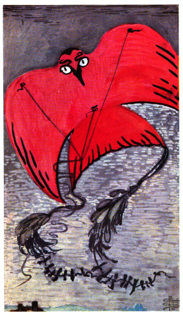
"The kite was shaped like a great hawk." [FACING PAGE 100.