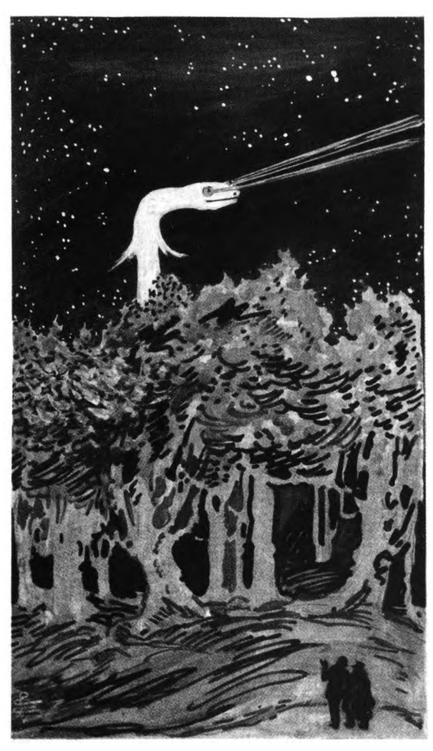
"They could follow the tall white shaft." [FACING PAGE 222.