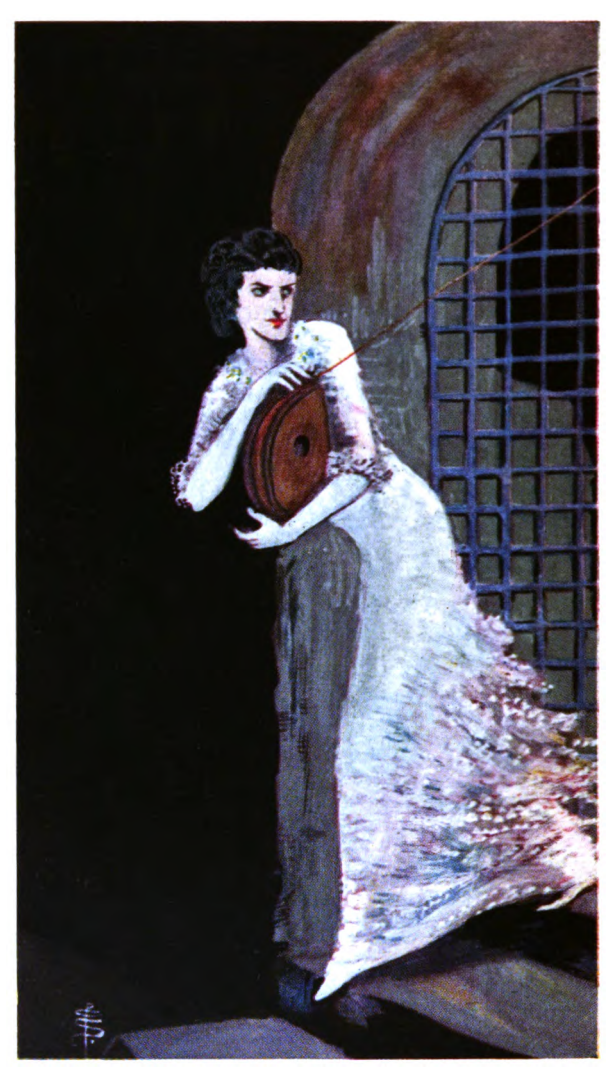
"Down the turret stair she flew quickly." [FACING PAGE 294.