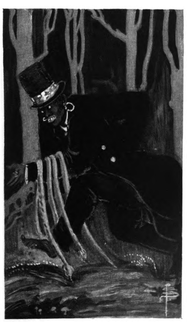
"Oolanga's black face . . . peering out from a clump of evergreens." [FACING PAGE 148.