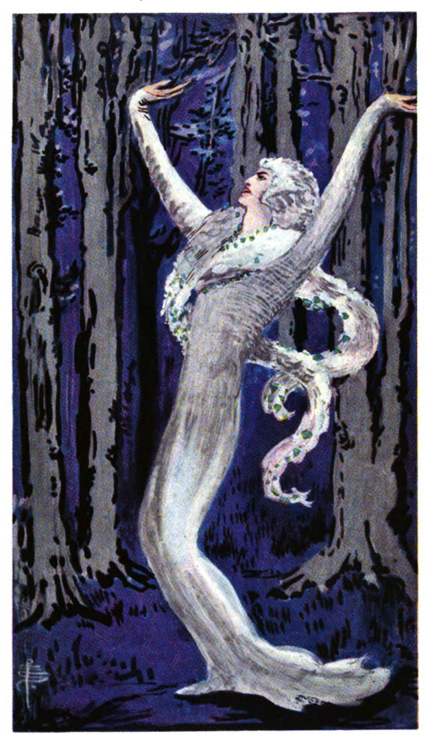
"Lady Arabella was dancing in a fantastic sort of way." [FACING PAGE 86