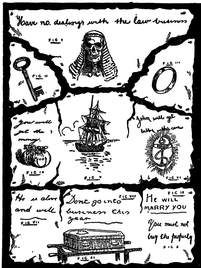
PLATE II. TEST CASES IN AUTOMATIC WRITING