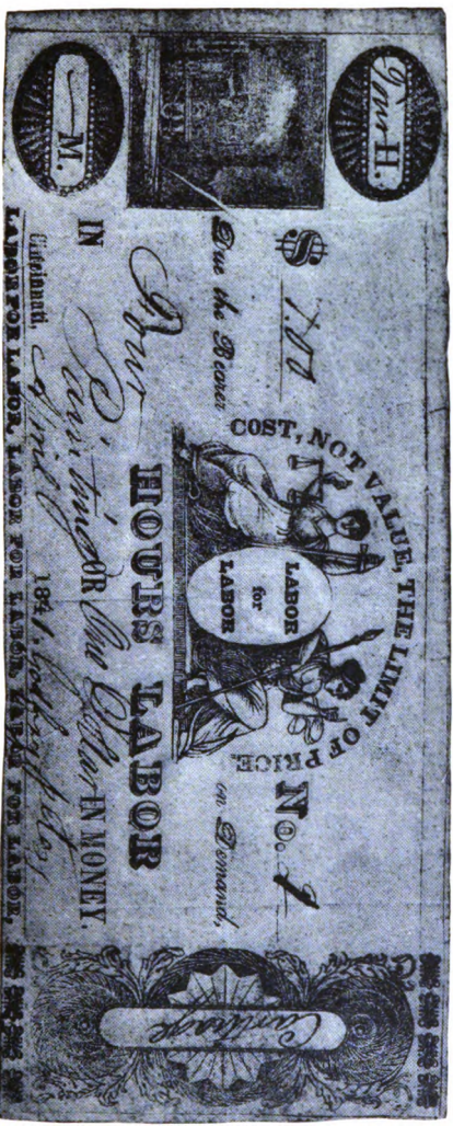
FACSIMILE OF A LABOR NOTE ISSUED AND USED BY JOSIAH WARREN