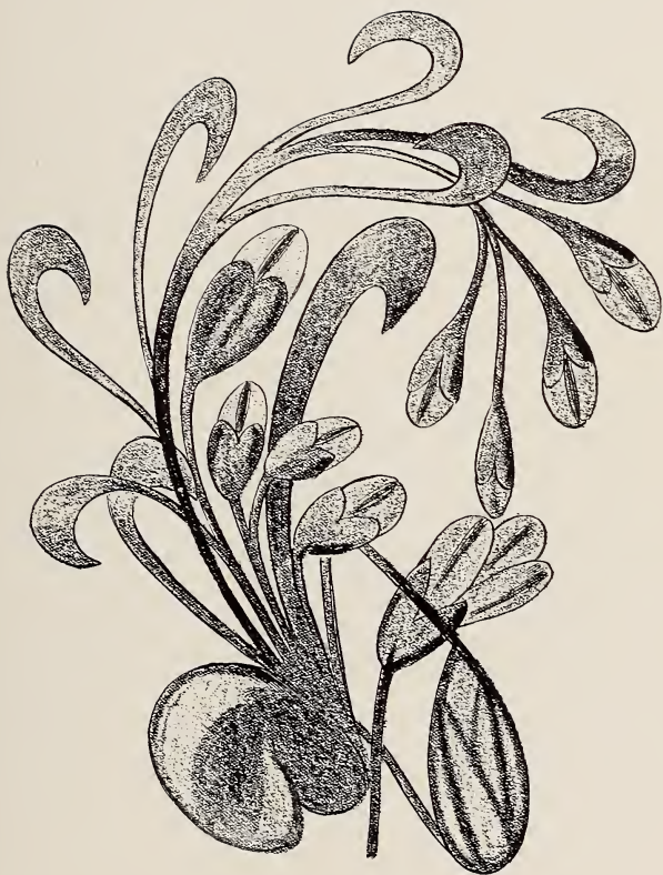
Rosera—an Ento Plant not found on Earth.