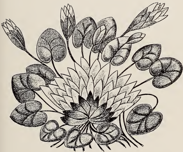
Rodel—the National Flower of Mars, Emblematic of Life and Death.