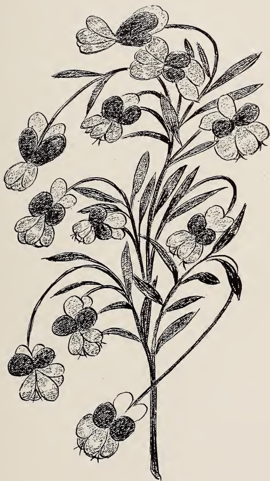
A Flower of Ento, Name Unknown.