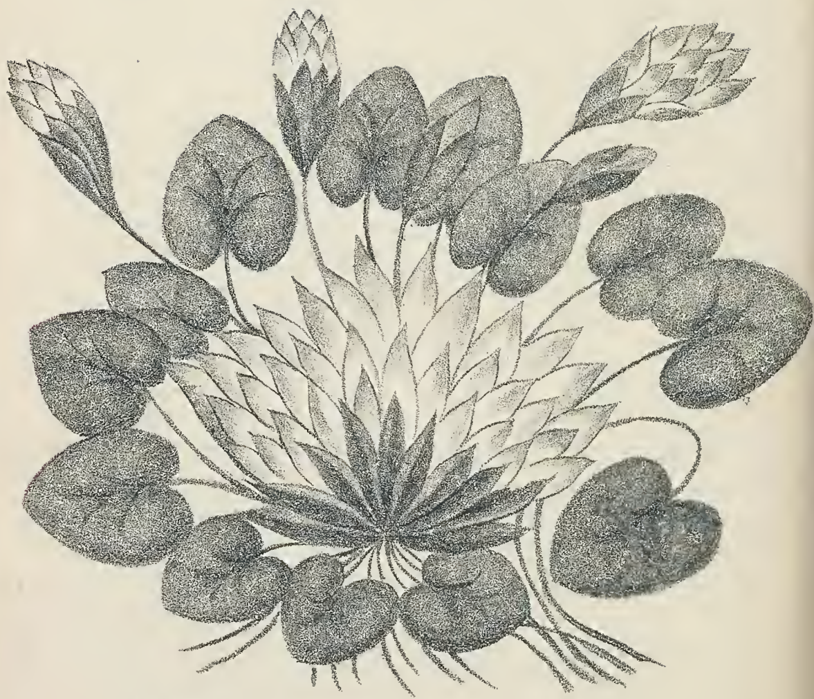
R O D E L. THE NATIONAL FLOWER.