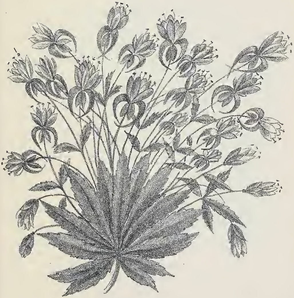
I S O I N A