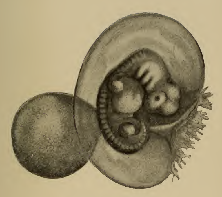
THE OVUM AT ONE MONTH.