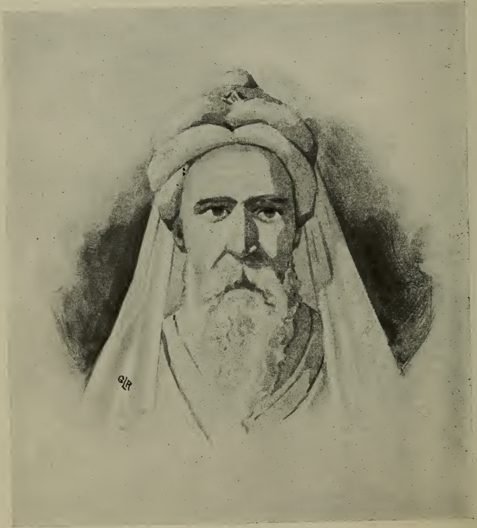
A TEACHER OF WISDOM AND KNOWLEDGE.