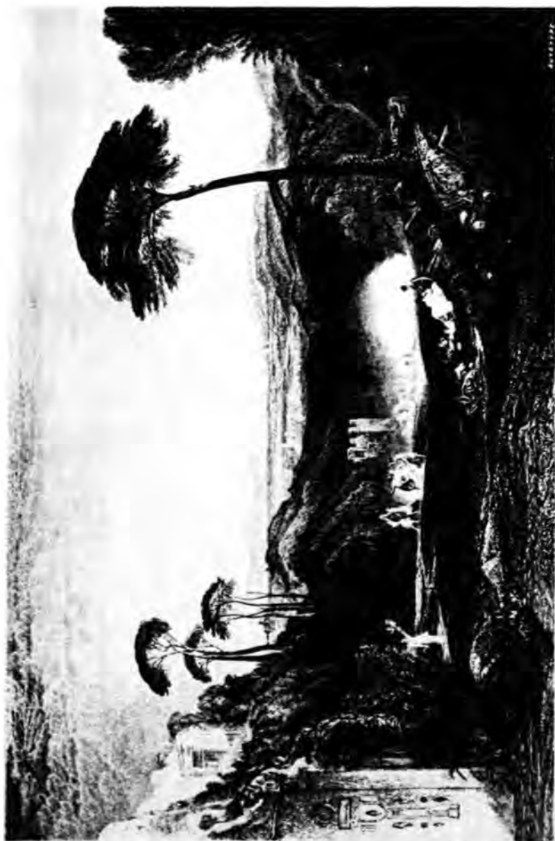
The Golden Bough.