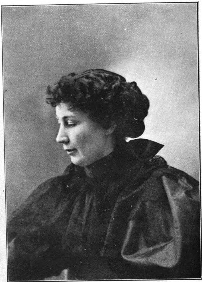
LULU HURST, ("THE GEORGIA WONDER,")