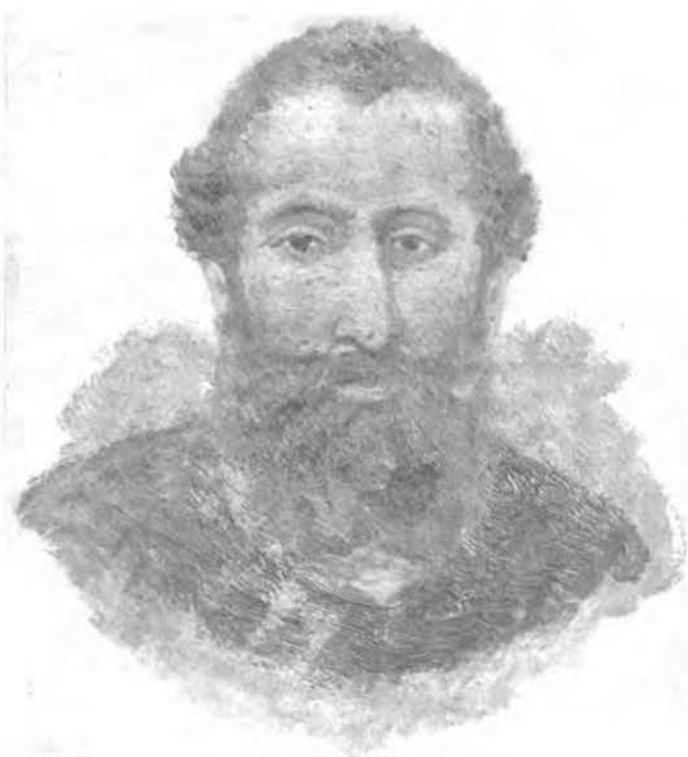
JOHN THE BAPTIST.