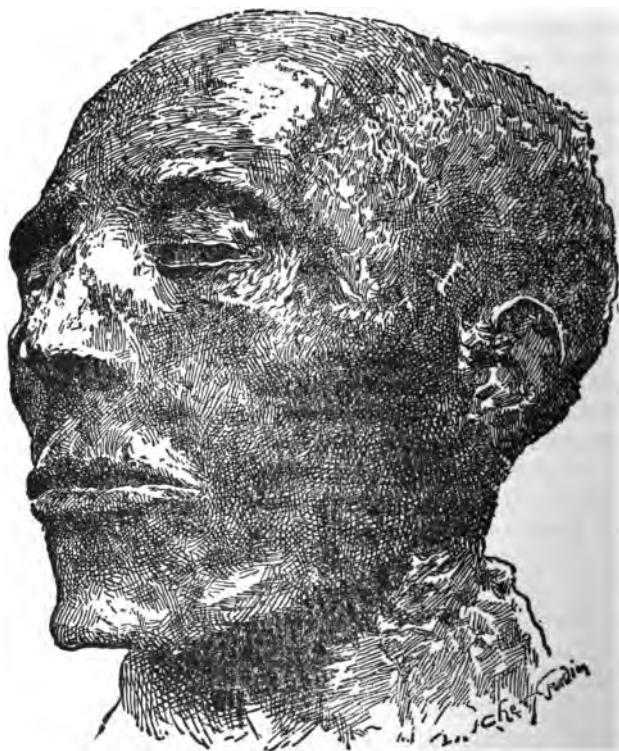
RAMESSES II. (PHARAOH).

Not many people know that the embalmed body of Pharaoh has been found, as the newspapers are so busily engaged in reporting murders and arguing politics that scarcely any of them even noticed this great "find."