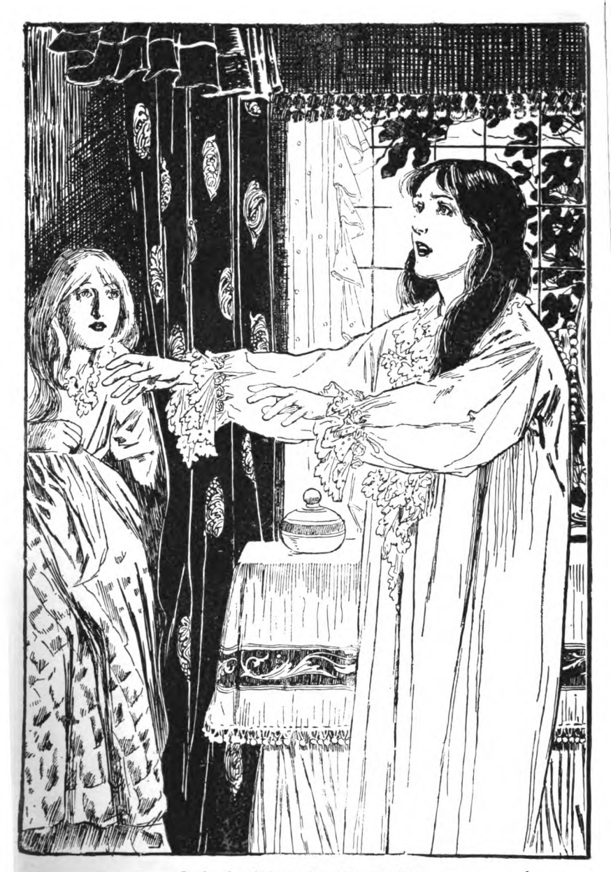
In the clear light stood a white-robed figure.