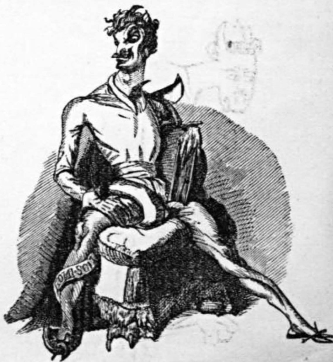
LANDSEER'S. ( Ten Etchings. )