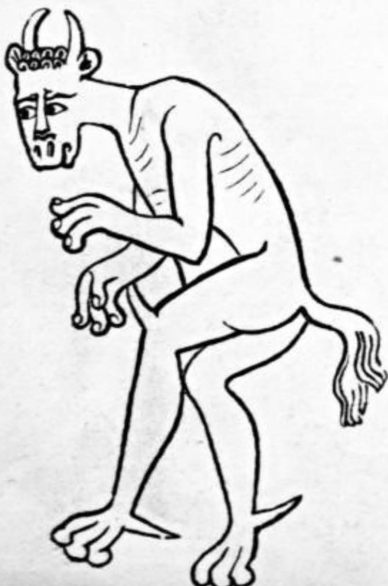
ENGLISH—XII. Cent.