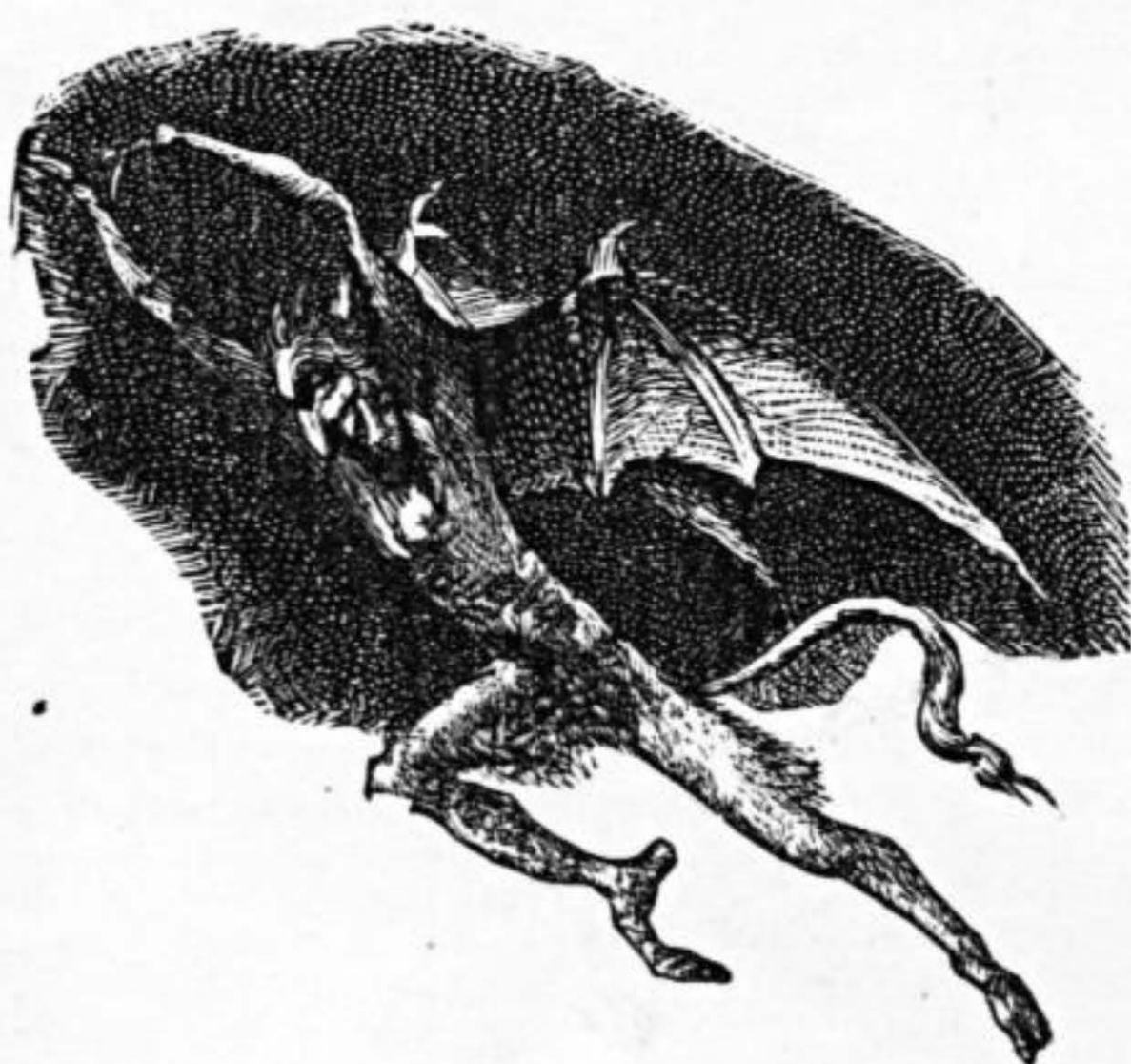
HINDU. ( Burton. )