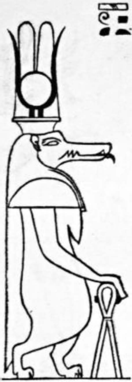
EGYPTIAN