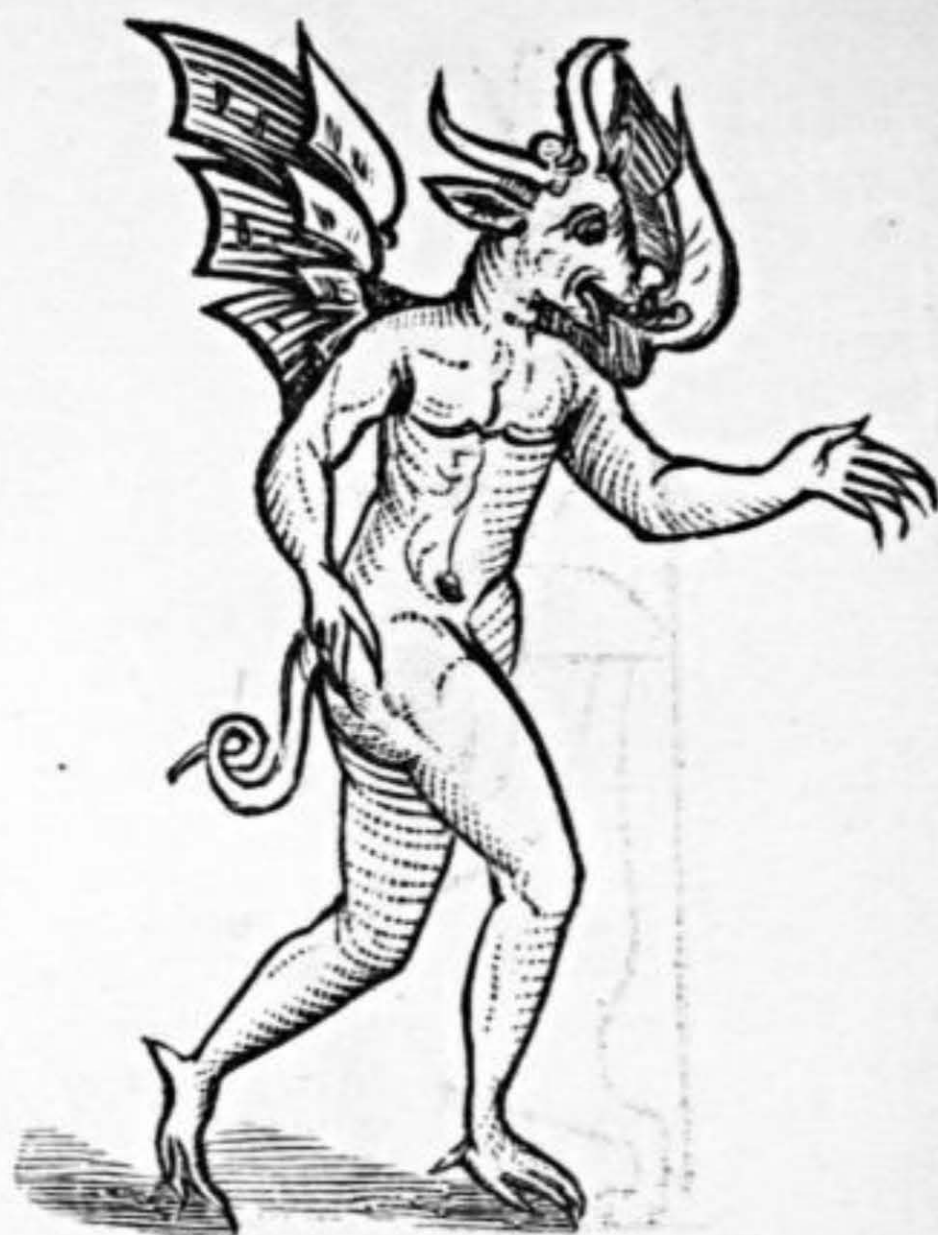
ITALIAN—XVII. Cent. ( Guaricus. )