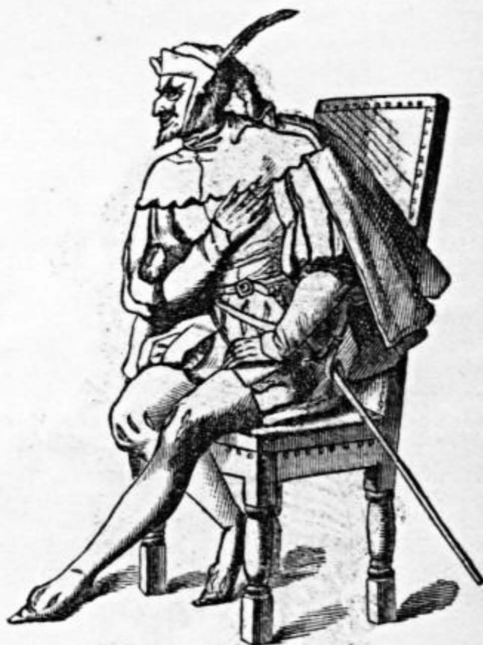
GERMAN. ( Goethe's Faust. )