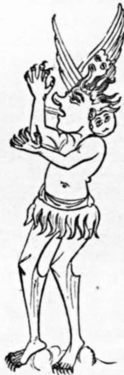
ANGLO-SAXON—XI. Cent. (Eng. Cyclo.)