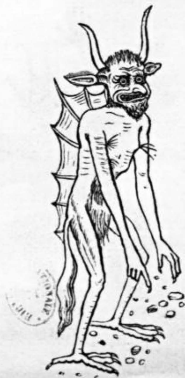
FRENCH—XV. Cent. (Eng. Cyclo.)