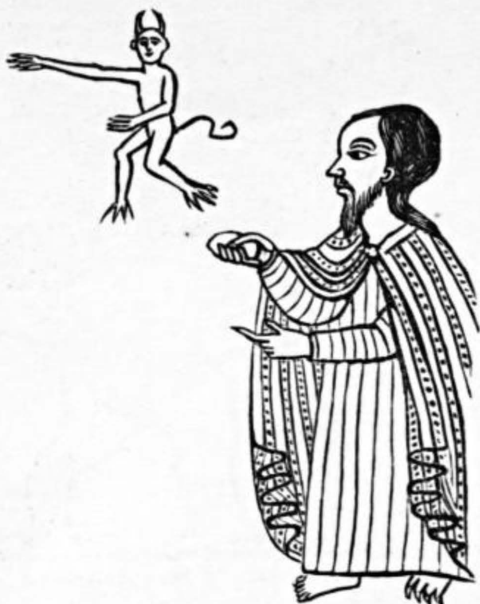
ABYSSINIAN—XVI. Cent. ( Eng. Cyclo. )