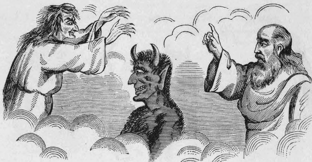
WITCH OF ENDOR.