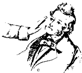
TOOTHACHE AND TIC.