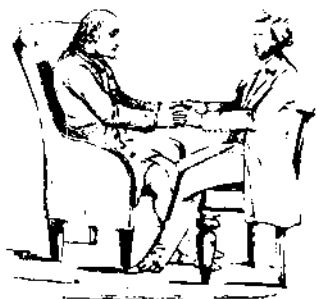
TRANSFUSION OF NERVO-VITAL POWER