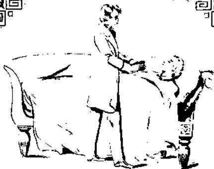
MESMERIZING A RECURRENT.