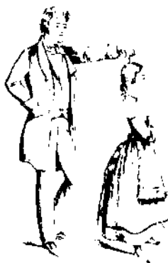
EXCITATION OF FIRMNESS.