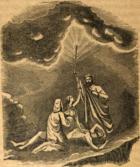
Justice and Mercy.—Page 185.