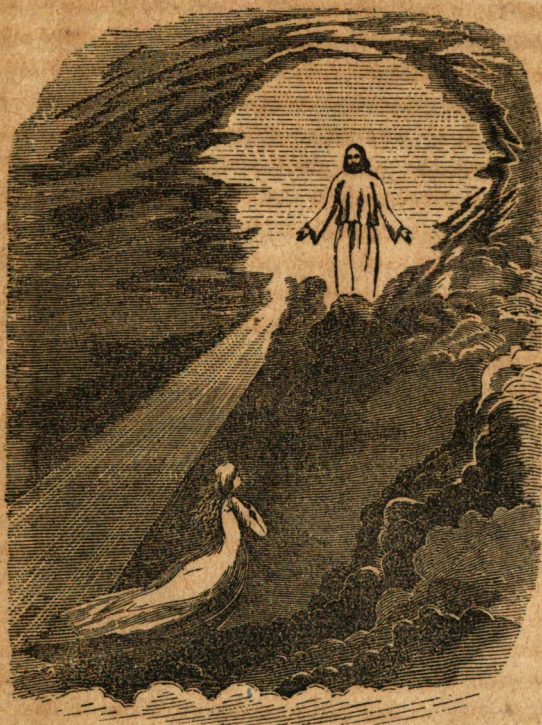
The Savior revealed in the cloud of night.—Page 78.