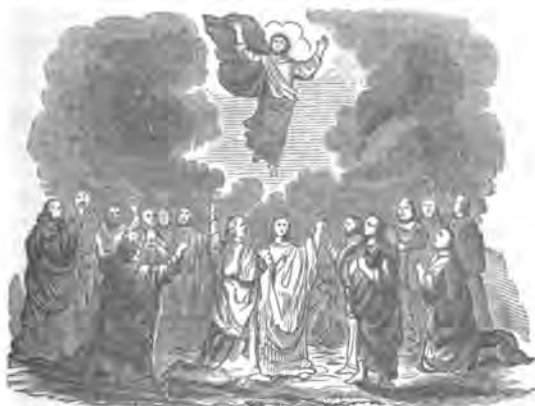
THE ASCENSION OF CHRIST.

He hath appointed a day in the which he will judge the world. Who shall judge the quick and the dead at his appearing and his kingdom.