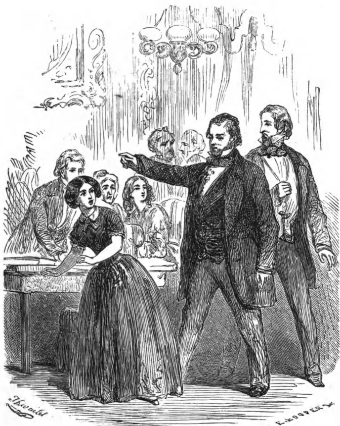
CASTING OUT THE EVIL SPIRITS.