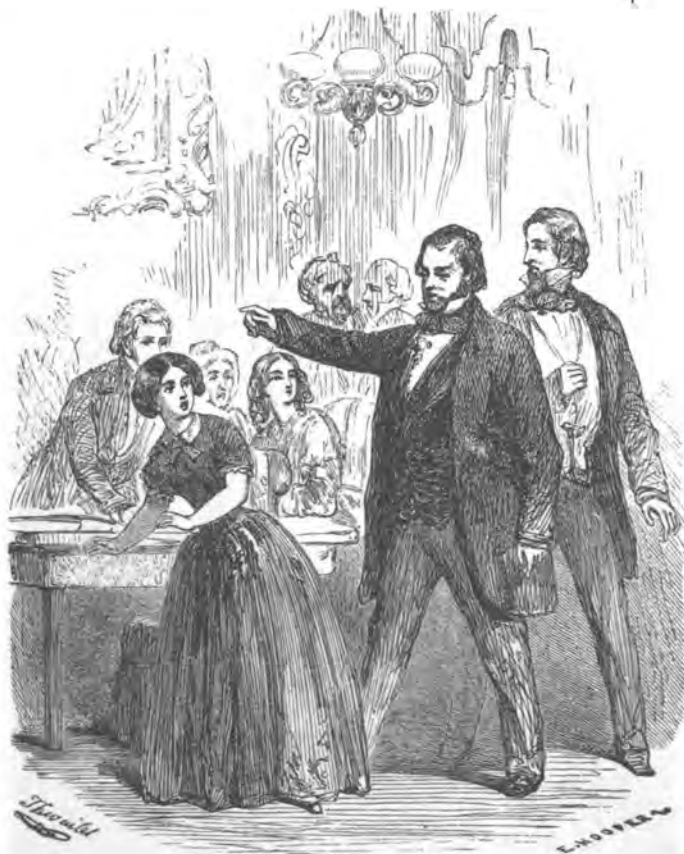
CASTING OUT THE EVIL SPIRITS.