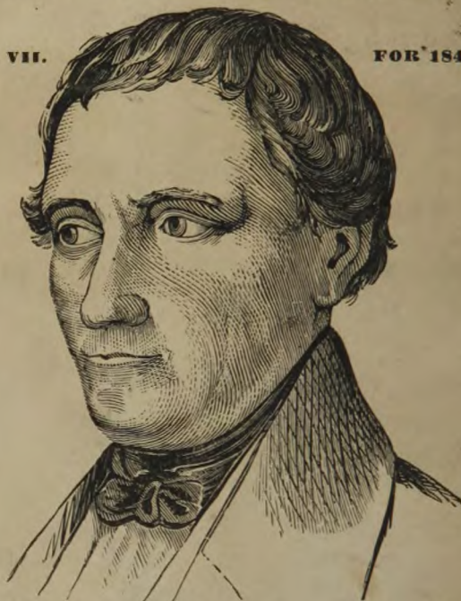
(PRIESSNITZ, FOUNDER OF THE WATER-CURE.)