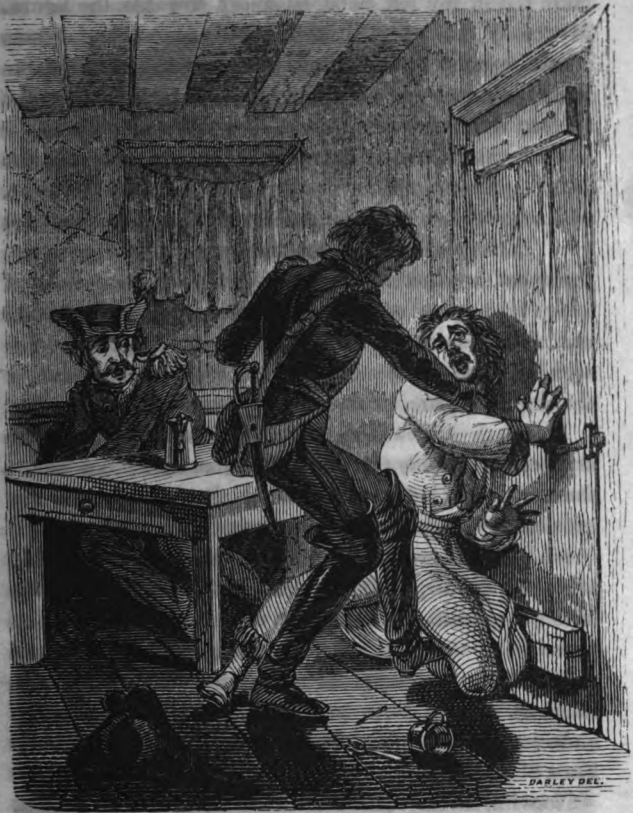
"I thrust the supposed culprit violently against the door, which stood ajar, so as to shut it."—Page 28.