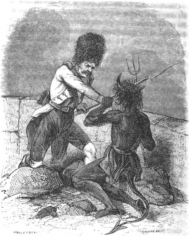
“He held him tightly grasped, regardless of the screams of agony which his nervous grasp extorted from the writhing demon.”—Page 71.