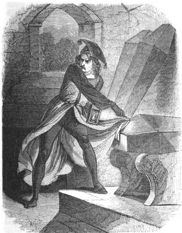
“The poor fellow, in his hurry, pinned his gown with the fork to the coffin.” Page 68.