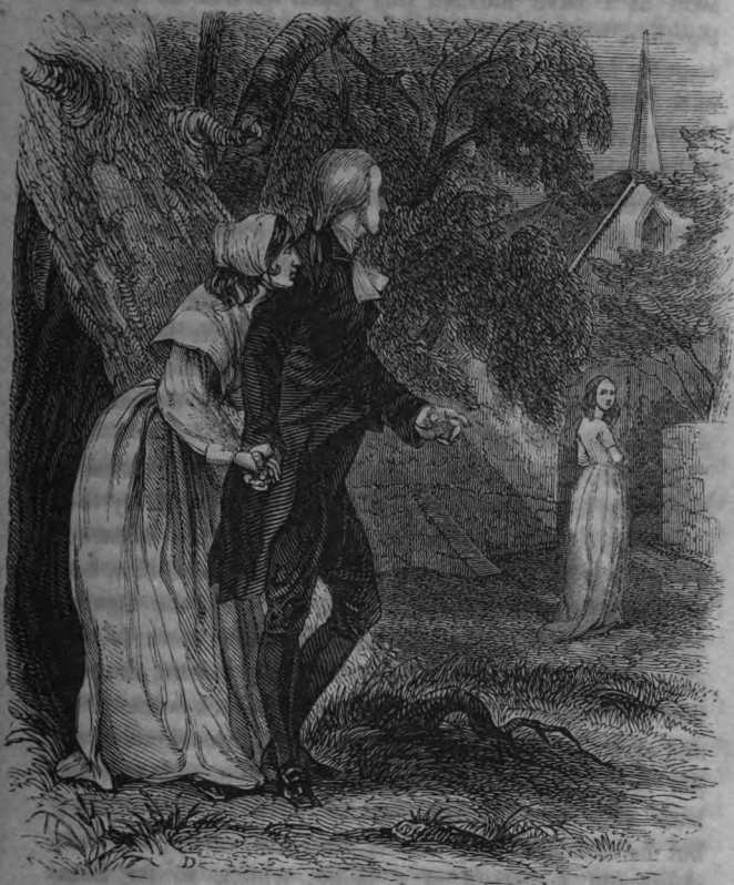
"The ladies started with affright from their seats, but the pastor, a courageous man, followed the apparition."—Page 90.