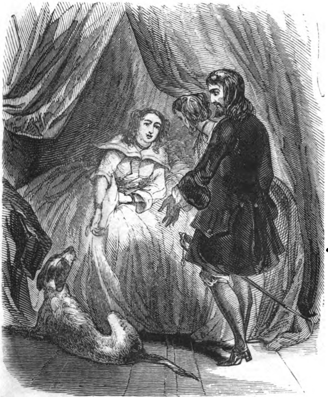
"There is the nocturnal visitor whom you have so long taken for the ghost of your mother."— Page 18.