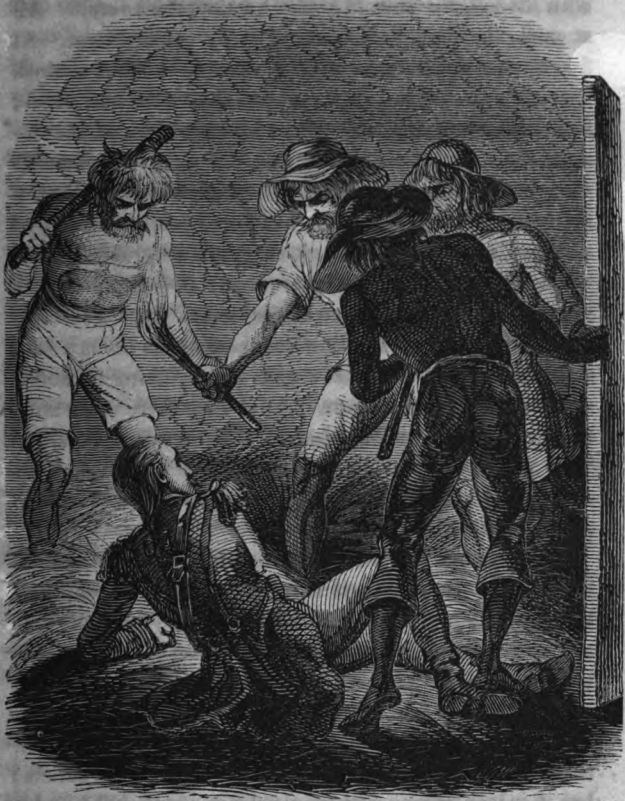
"At the report, four sturdy fellows approached him with lights."—Page 101.