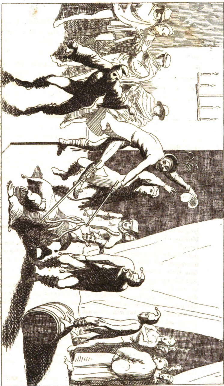
Faithfully copied by George Cruikshank from an original Old Picture 12 inches high by 25 inches wide in the possession of William Hoare.