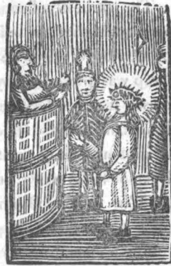
Christ brought before Pilate.

The inscriptions are placed beneath the cuts exactly as they stand in the original sheet.