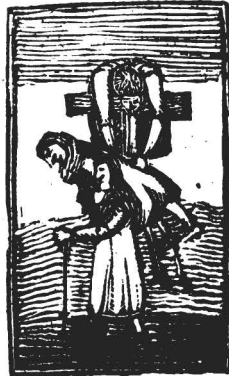
Taken down from the Cross.

at the table; in the middle sat the Dean, and those of the king's chapel, who immediately after the king's first course 'sang a caroll.'—( Leland. Collect. vol. iv. p. 237.)—Granger innocently observes that 'they that fill the highest and the lowest classes of human life, seem in many respects to be more nearly allied than even themselves imagine. A skilful anatomist would find little or no difference in dissecting the body of a king, and that of the meanest of his subjects; and a judicious philosopher would discover a surprising conformity in discussing the nature and qualities of their minds.'— Biog. Hist. Engl. ed. 1804, vol. iv. p. 356.