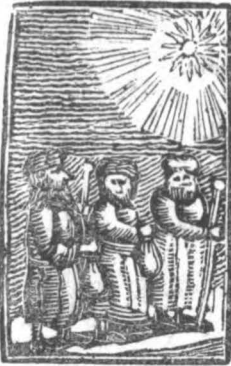
3 Wise Men.