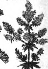
44. Ladies Bedstraw