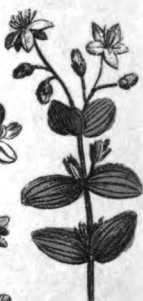
64. St. Peter's Wort