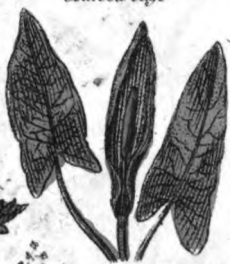
17. Cuckow Point