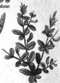
67. Rest Harrow