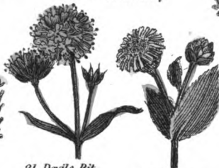
21. Devils Bit