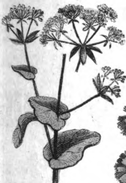
82. Thorough Wax