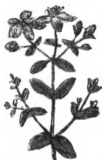
41. St. John's Wort