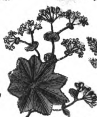
43. Ladies Mantle