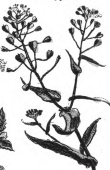
75. Shepherd's Purse