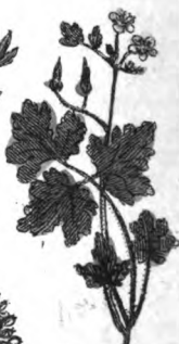
37. Herb Robert