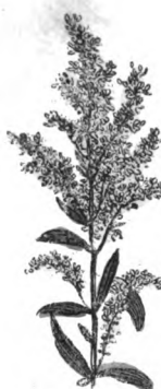
31. Golden Rod