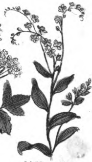
54. Mouse Ear