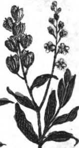
58. Treacle Mustard