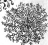
68. Rupture Wort