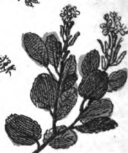
40. Jack by the Hedge