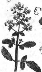
6. Water Betony