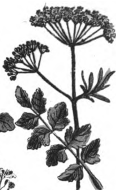
72. Burnet Saxifrage