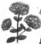
50. Wild Marjoram