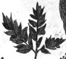
96. Butchers Broom