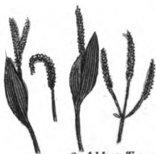
3. Adders Tongue