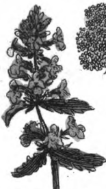
7. Wood Betony