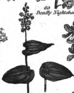
62. One Blade