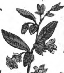
60. Deadly Nightshade