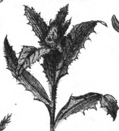
87. Blessed Thistle