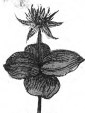
38. Herb Truelove