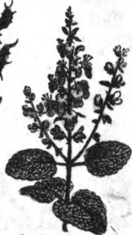
81. Wood Sage