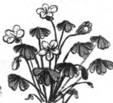
77. Wood Sorrel