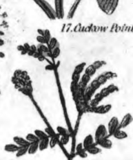
93. Birds Foot