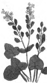
72. Burnet Scurvygrass