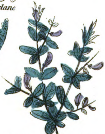
67. Rest Harrow