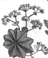
43. Ladies Mantle