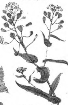
75. Shepherd's Purse