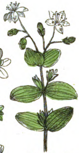
64. St. Peter's Wort