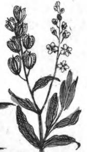
58. Trache Mustard