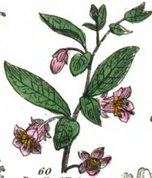
60. Deadly Nightshade