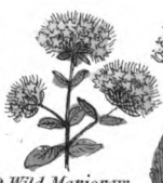
50. Wild Marjoram