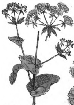
82. Thorough Wax