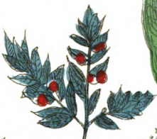
96. Butchers Broom