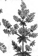
44. Ladies Bedstraw

Published by B. Crosby & Co. July 1 st 1869.