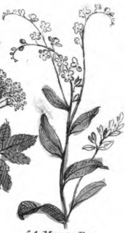
54. Mouse Ear