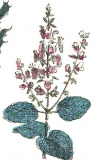
81. Wood Sage