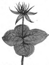
38. Herb Truelove