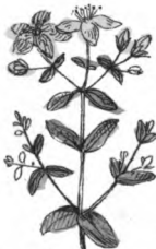
41. St. Johns Wort