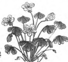
77. Wood Sorrel