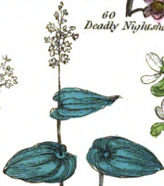
62. One Blade