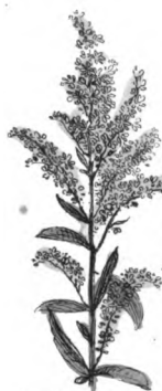
31. Golden Rod