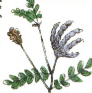
98. Birds Foot

Published by B. Crosby & Co. July 1 st 1899.