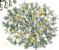
68. Rupture Wort

Published by B. Crosby & Co. July 1 st 1869.