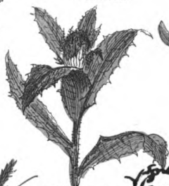
87. Blessed Thistle