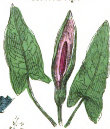
17. Cuckow Point