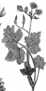
37. Herb Robert