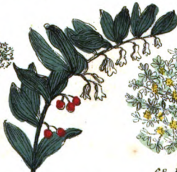
69. Solomon's Seal