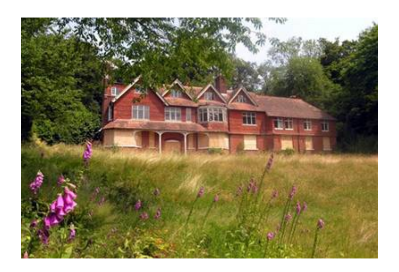
HELP TO SAVE A.C.D.'s OLD HOUSE!

Psypioneer will continue our celebration of this 150th year with more rare ACD material in the next issue: