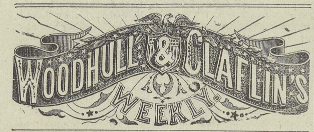
NEW YORK, SATURDAY, FEB. 6, 1875.