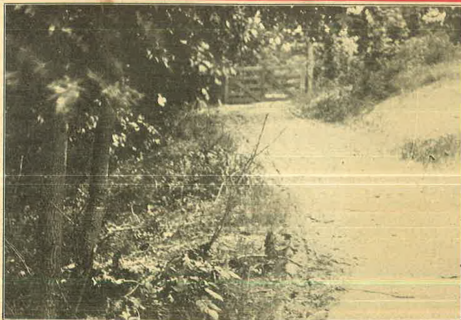
THE ROAD AHEAD

Forget the roads behind, Life's gates are all ahead, What souls the past can bind, Life numbers with the dead.