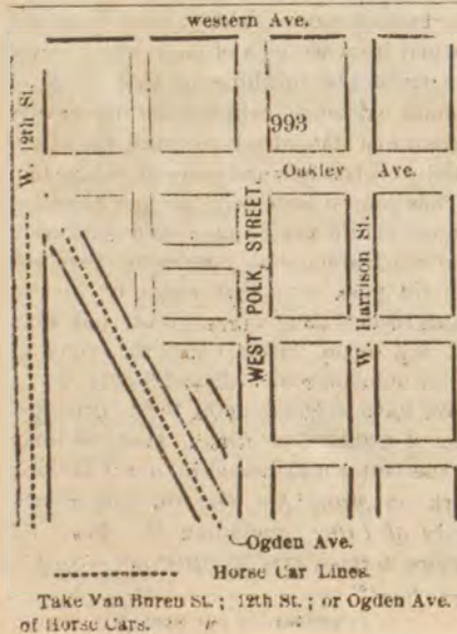
Diagram Showing the Location of the Office of THE WATCHMAN.

We open our columns to the public and invite correspondence; reserving the right to reject any communication that we deem improper to be issued in our columns. Under no consideration will anonymous letters be published: we require the name and address of the writer as a guaranty of good faith.