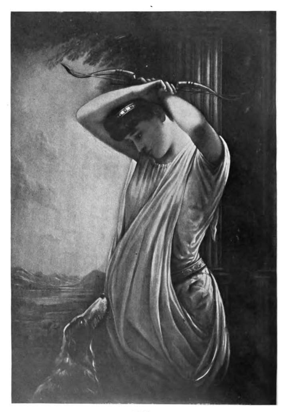
DIANA. Reproduced from an engraving by permission of Wm. Pate & Co., New York.