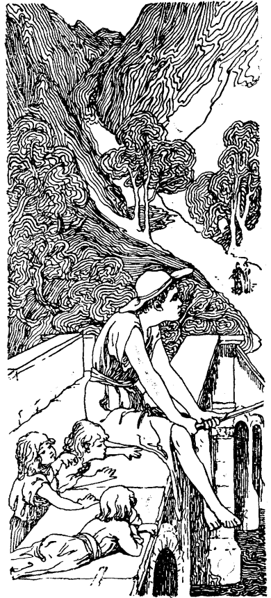
THE PHILOSOPHER PRETENDING TO FISH

At last the fame of his wisdom reached the ears of the Emperor who was just then trying to decide which of two wise men to choose as Governor of a great Province. They were both so learned that they each knew as much as the other, and they were both so clever that each was able to make speeches that the other could not understand, and the questions they put to one another were so learned that it took three days to answer any one of them. The Emperor went to sleep during the debate and all the courtiers put their hands over their eyes so as to look as if they were thinking very hard, and when any one snored those who were awake looked sad and shocked and then went to