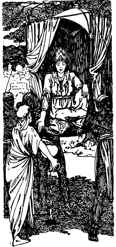
THE POOR WOMAN EMPTIES A PITCHER OF WATER

Seeing how kindly she was treated, she thought she might try for more and said :