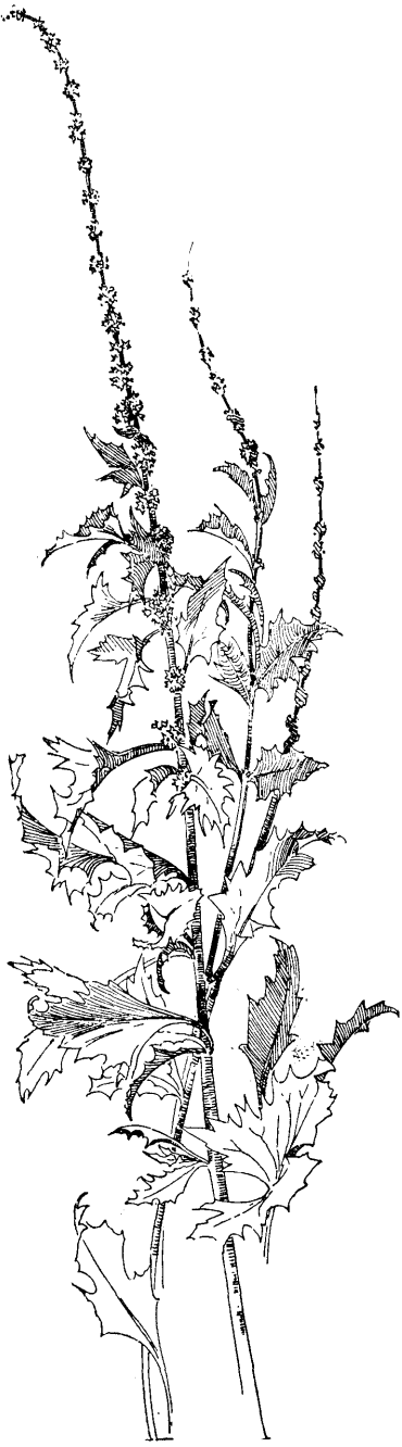
A SPRIG OF ACANTHUS FROM POINT LOMA

I was gathering wild hyacinths, that grow on the hillside in the brush and the dead sage bushes. I saw how they grew right up in the thickest part of an old dead bush, and seemed to spring straight from the ground as if they had no root, and I wondered how they were sown there. The sun came over the hill and the sea sang its song in the morning air and I felt the presence of one I had left in a land far away, and a smile of quiet joy seemed to float somewhere around me, and as I stooped to gather a beautiful blossom, I suddenly knew how they came to be planted there on the wild hill-side, where such a peace prevails that one may easily know the flowers that blossom just there have their roots in the fairy world, and the seed that is planted there is a thought from a loving heart, that has given all that it had in life to give to the Lotus Mother to help her work. And every day a loving thought goes out to the Heart of the Lotus Mother, and so there are always plenty of blossoms down there in the brush. The guests who lunch at the Homestead have bunches of wild hyacinths