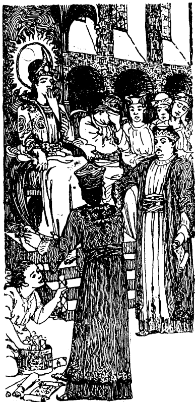
THE TWO WISE MEN ARGUING BEFORE THE EMPEROR

Then the two who came from the Emperor were silent, and the villagers were all proud of their philosopher and the children climbed on the parapet of the bridge and the birds began to hover round and the fishes were all gathered in a great mass near the top of the water, and the philosopher turning his back to the people began to talk to the fishes and the birds and the children. He called them all his brothers and he talked of the beauty of living and spoke of the "sunlight of Life." His voice was soft and singing and seemed to get like the voice of the wind in the trees and then like the voice of the stream as it gurgled over the stones, and at times it was like the voice of a child when it chuckles with quiet delight and yet it was still the voice of the man, and the words that he spoke were simple, and wise, and loving and full of joy. The villagers crowded around and the children stared and smiled, some with their mouths wide open, others with their hands clasped tight, and all their eyes fixed on the