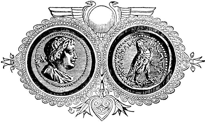
COIN OF PTOLEMY PHILOPATOR.

In the governing of Egypt he followed the policy of Alexander. He ruled each people by its own laws, the Greeks as Greeks, while he left Egyptian matters to be administered by priests, giving the latter all the privileges and immunities which they had before enjoyed. The Apis died, and he spent fifty talents (forty thousand dollars) on the funeral. The priests of Thebes were now at liberty to cut out from the inscriptions the names of the usurping divinities, and restore the former ones that had been removed. The inner shrine of the temple at Karnak which had been overthrown by the Persians, was now rebuilt.