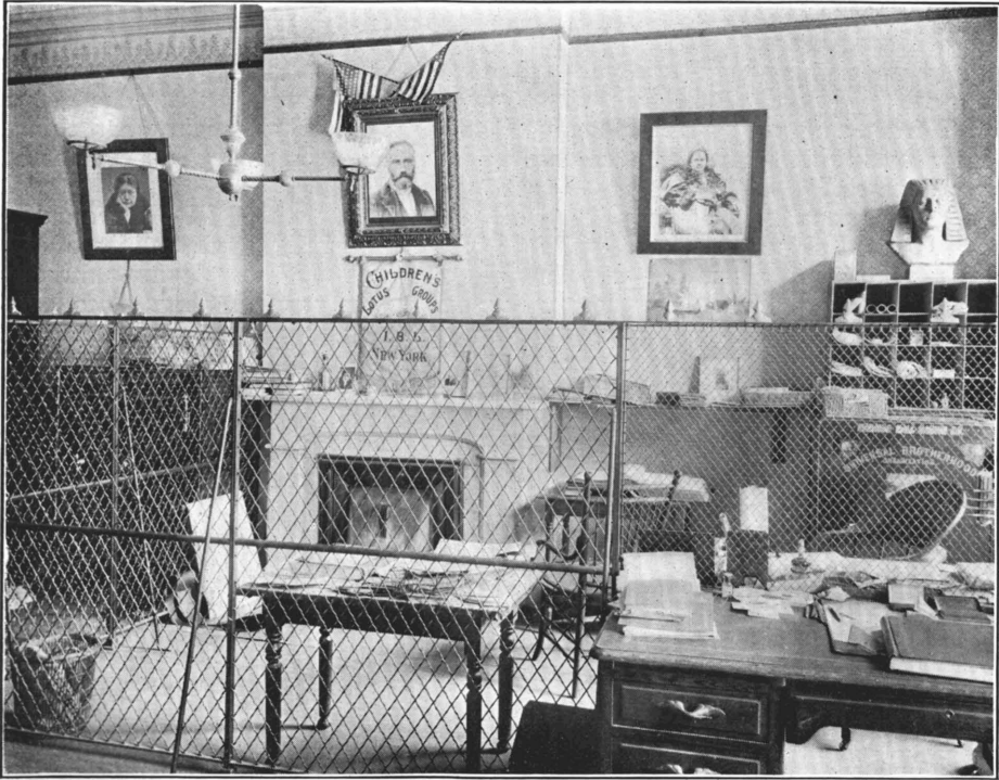
OFFICES OF THE UNIVERSAL BROTHERHOOD ORGANIZATION AT 144 MADISON AVENUE, NEW YORK.