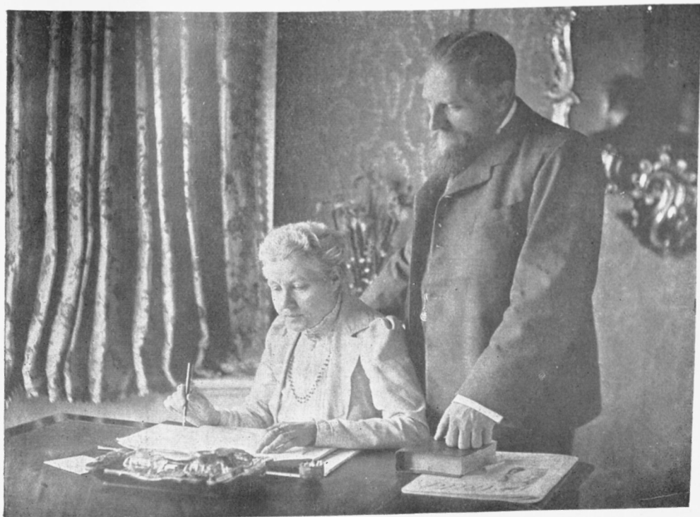
ANNIE BESANT (1847—1933)