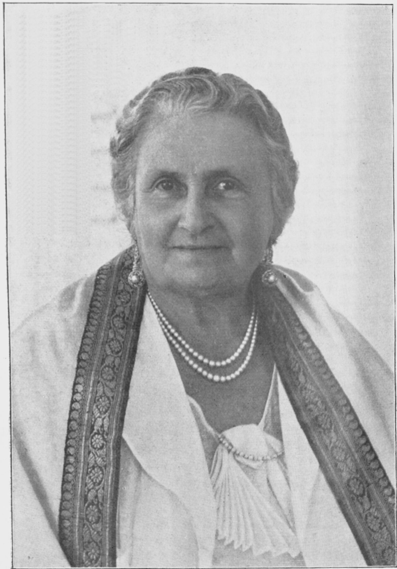
DR. MARIA MONTESSORI