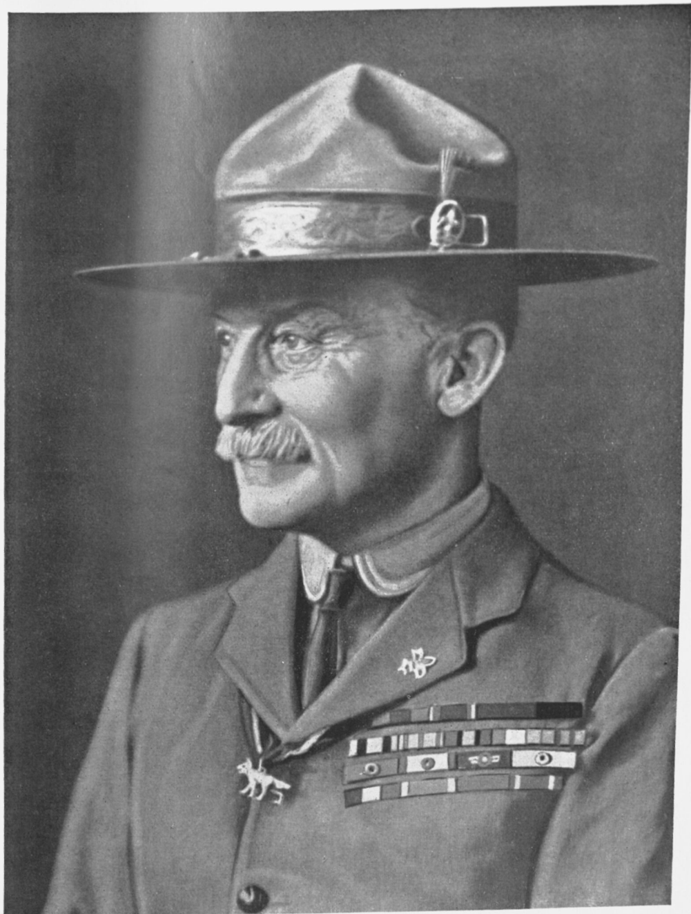
LORD BADEN-POWELL, 1857—1941

Founded the Boy Scouts organization in 1908. Chief Scout of the world, 1920—41.