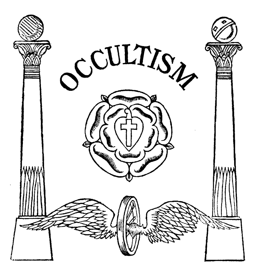
THE OCCULTIST AND THE MYSTIC