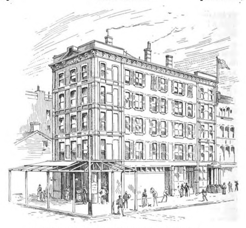
THE HOUSE IN WHICH "ISIS UNVEILED" WAS WRITTEN.

ment. A flat was taken afterwards on the corner of 47th street and Eighth avenue, in the house which is shown in the picture.