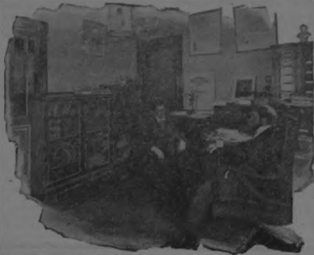
PRIVATE CONSULTATION AND EXAMINATION OFFICE.

I found the Doctor most comfortably situated, his accommodations embracing all modern conveniences. Believing that a healthy mind cannot exist without a healthy body the Doctor has taken especial pains to preserve his own health and physical strength. For this purpose he has several thoroughbreds and any nice morning you will find him enjoying a drive upon