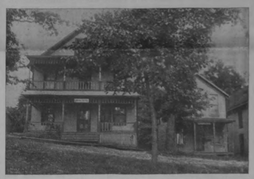
Lodging House and Ladies' Bazaar.

AMUSEMENTS. Mt. Pleasant Park will be open to campers from June 15th to September 15th.