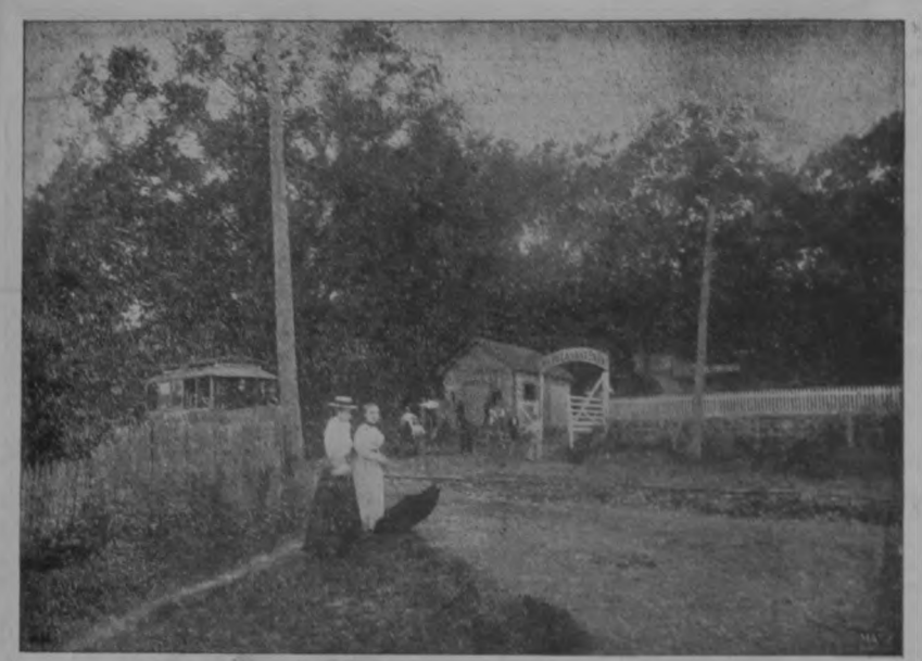
Entrance to Grounds of Mt. Pleasant Park.

door and blind factories, five large cities. lumber mills employing over 2,000 men, a large pork and beef packing