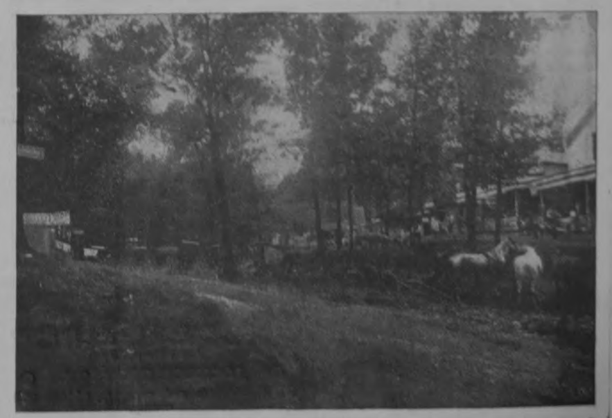
Maquoketa Avenue, Looking West from Entrance.