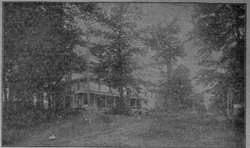
THE LEOLYN SITTING ROOM.

A fine summer home on the bank of one of the Cassadaga Lakes. The lake on the west side, the primitive forest on the east, and beautiful parks on the north and south. Good boating, fishing and magnificent drives.