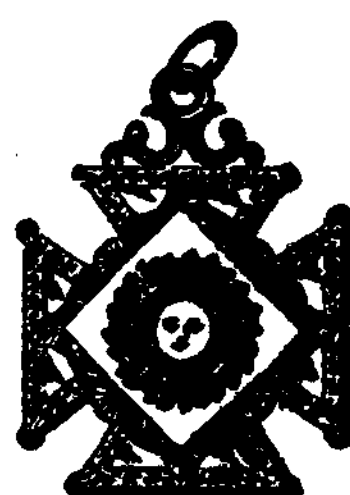
MALTESE WATCH CHARM.

This is a very neat charm. The back is plain and any desired emblem may be mounted on it or it can be inscribed. Many think the Maltese Cross is a strictly Masonic emblem; such is not the case, as it is used by many orders. Price, $5.00