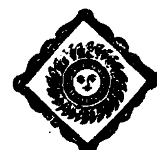
BADGE PIN, $1.50

The center of the design represents a human face, the highest type of intelligence; the face is encircled by the band of darkness symbolizing the ignorance and superstition of humanity; this is broken by the rays of light from the center of intelligence which pierce the darkness and join the light of the golden leaves beyond. Each leaf symbolizes one of the principles of nature on which progression is based. This design is set in the center of a pure white field, symbolizing purity, while its position in the center of the square is a symbol of justice. The whole is enclosed by the solid band representing the unity of humanity, while the ornamentation of the band symbolizes the kindnesses extended to others. As the sunflower turns its face towards the sun, so Spiritualism turns the faces of humanity from darkness and superstition towards the Sunlight of Truth and Progression.