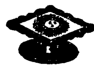
LAPEL BUTTON, $1.50