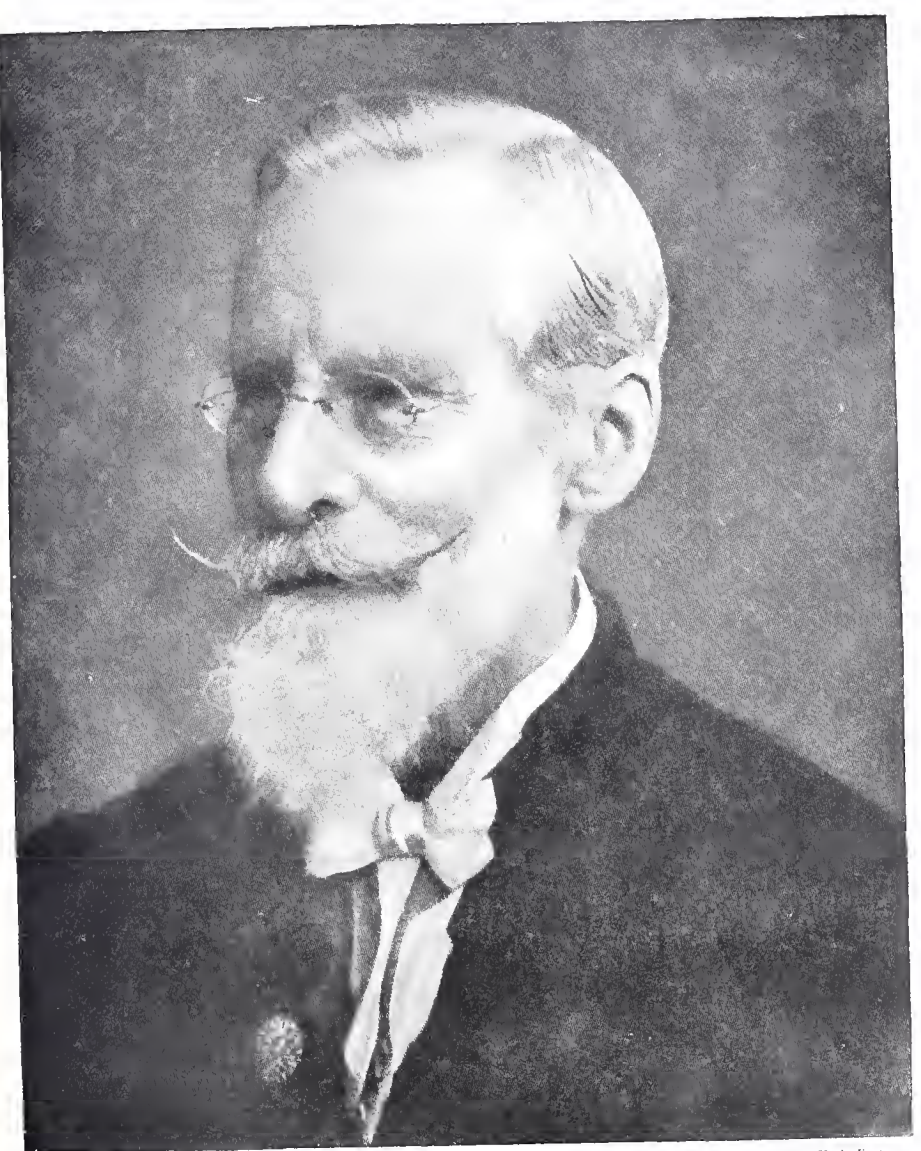
SIR WILLIAM CROOKES, O.M., F.R.S.