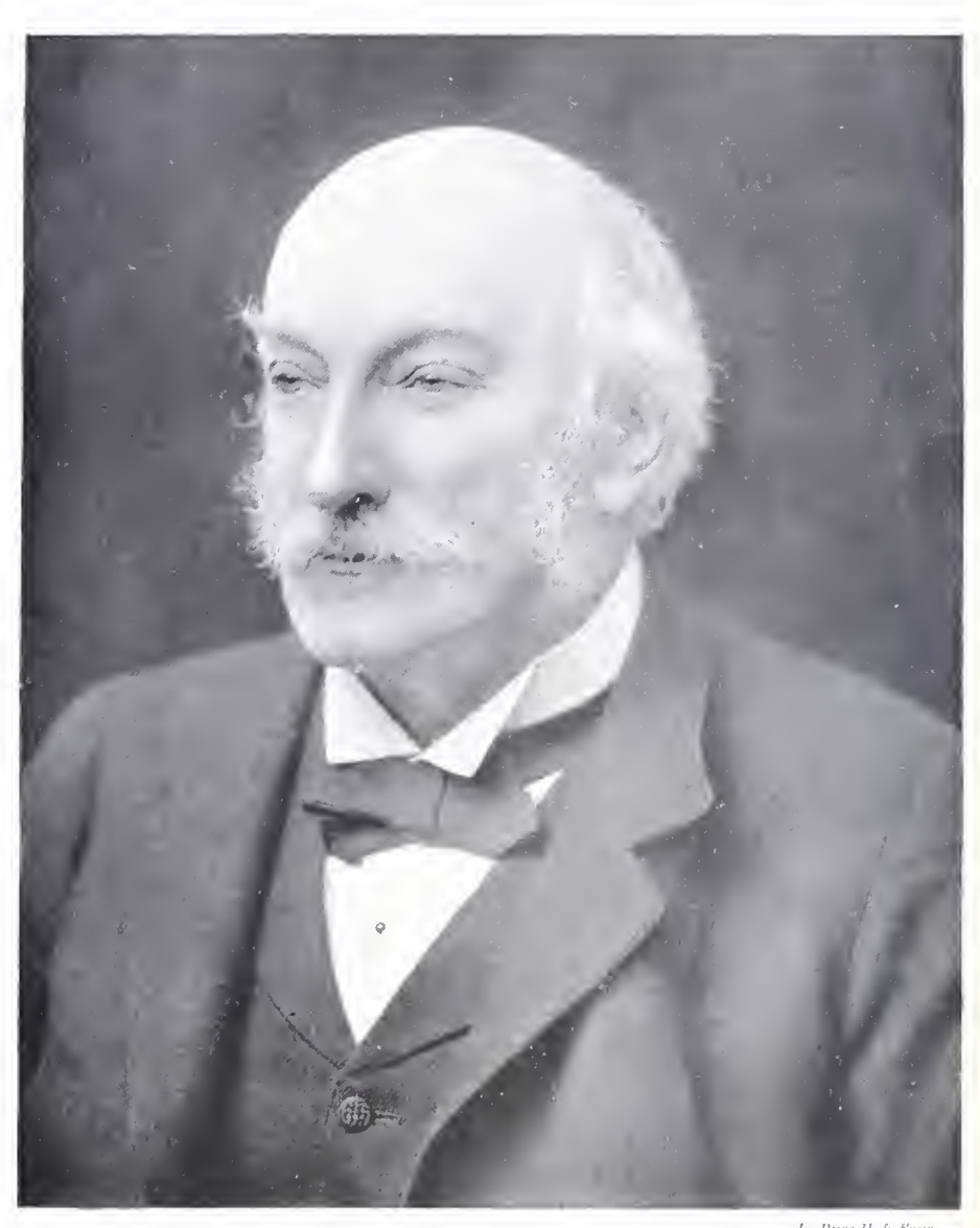
THE RIGHT HON. LORD RAYLEIGH, 0.M., F.R.S.