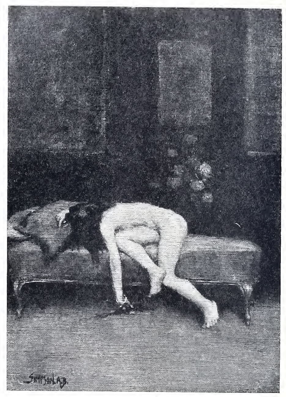
LE CANAPÉ BLEU.