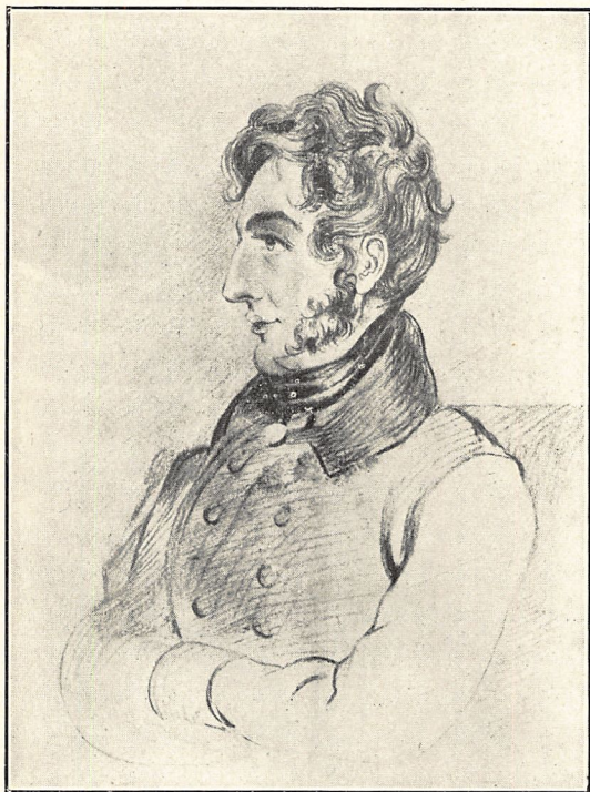
EDWARD BULWER, FIRST LORD LYTTON