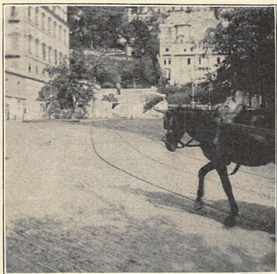
Patiently Uphill in Naples!