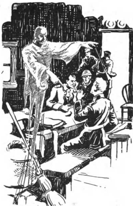
He heard, or imagined he heard, a voice telling him to leave the building at once. (Page 20.)

Now, on one theory of this case, this man had received a direct warning from the spirit world. It is not, however, necessary to assume this. It is quite possible that the mind is capable of receiving impressions of which we now know nothing. Some of the lower animals have senses which we do not understand.