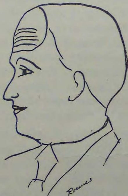
The Region of the Senses

Benevolence is the most unselfish of the faculties, and when a strong will is seen at the top of the head above the ear its possessor will be a fighter for the