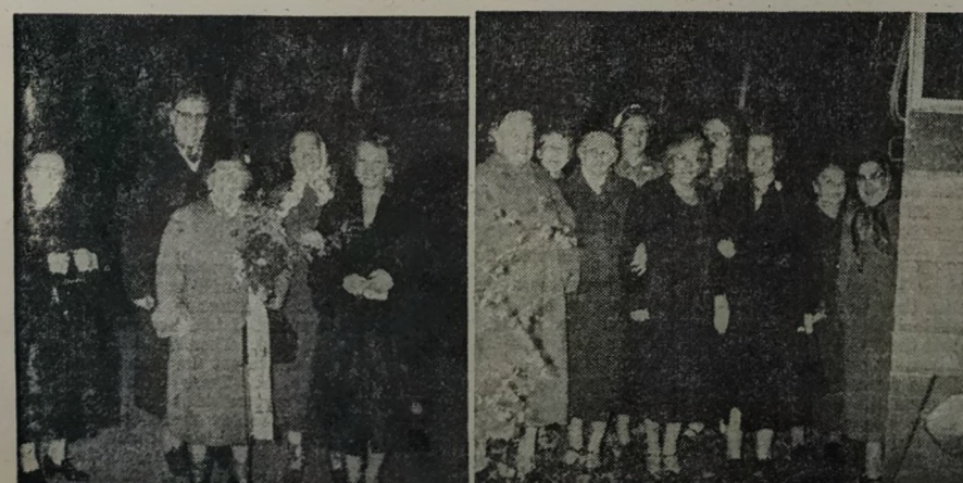
TIME TO GO HOME ... To the left are Spiritualists from New York City and to the right, Spiritualists from New Jersey, boarding the buses to return to their homes after attending the Harvest Home Festival.